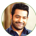
Jr. N.T. Rama Rao Indian Actor Vignan Group*