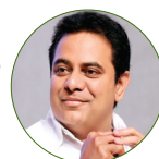
K.T. Rama Rao Minister of Municipal Administration & Urban Development (Telangana) Vignan Group*